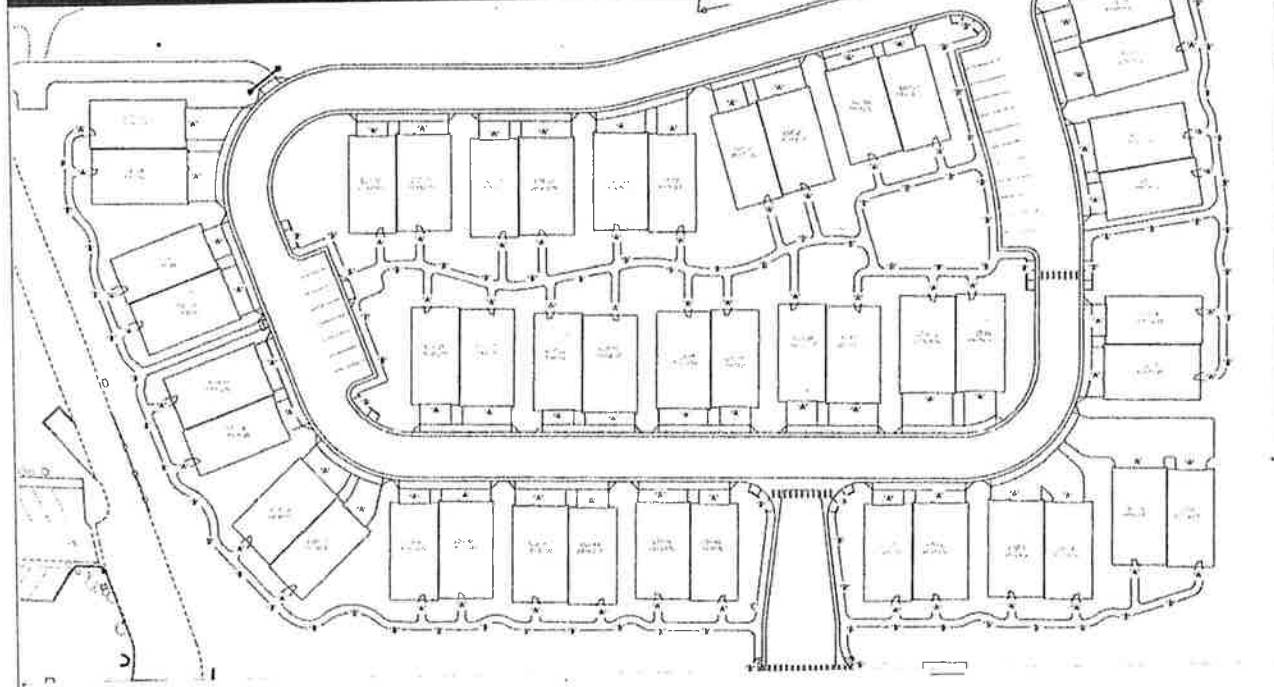
Autumn Wood - Development Plan 2017